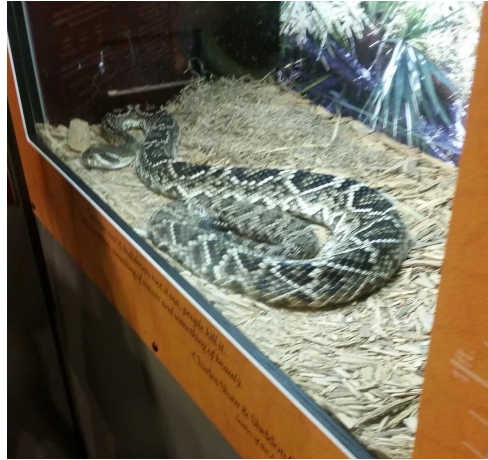
Right: A live rattlesnake from the Rattlesnake exhibit.

On Friday, September 6, 2019, the 7th graders took a field trip to the Sternberg Museum. The museum was very impressive, including a huge, realistic, robotic t-rex exhibit that moved. One of the most memorable exhibits was the world-renowned "Fish Within a Fish" exhibit, displayed for all to see upon first entering the exhibit area on the first floor. The class also got to see various types of live rattlesnakes and tortoises. However, due to remodeling, the class didn't get to visit the whole museum, including an Ice Age section. After touring the museum, the class ate lunch at Frontier Park which once connected the historic Fort Hays with the city of Hays. According to the sponsor and history teacher, Mr. Bauer, the most memorable and student-bonding moment of the trip was a student losing their cellphone in the river at the park and the resulting search. Jorja Blakeslee's commented, "I think the trip was very fun. Besides the phone in the water, the best part was the waterfall."